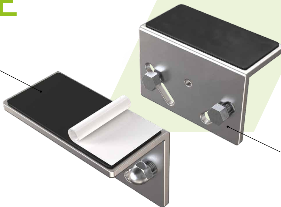
LOW PROFILE ADJUSTABLE BRACKETS

Our Fire Retardant Self-Adhesive Tape has been introduced for use with our Adjustable Pedestals and Adjustable Pedestal Brackets. It features a flame retardant adhesive which is coated on a flame retardant acrylic foam carrier and has a very high-performance adhesion to metal, making it perfect for use with our